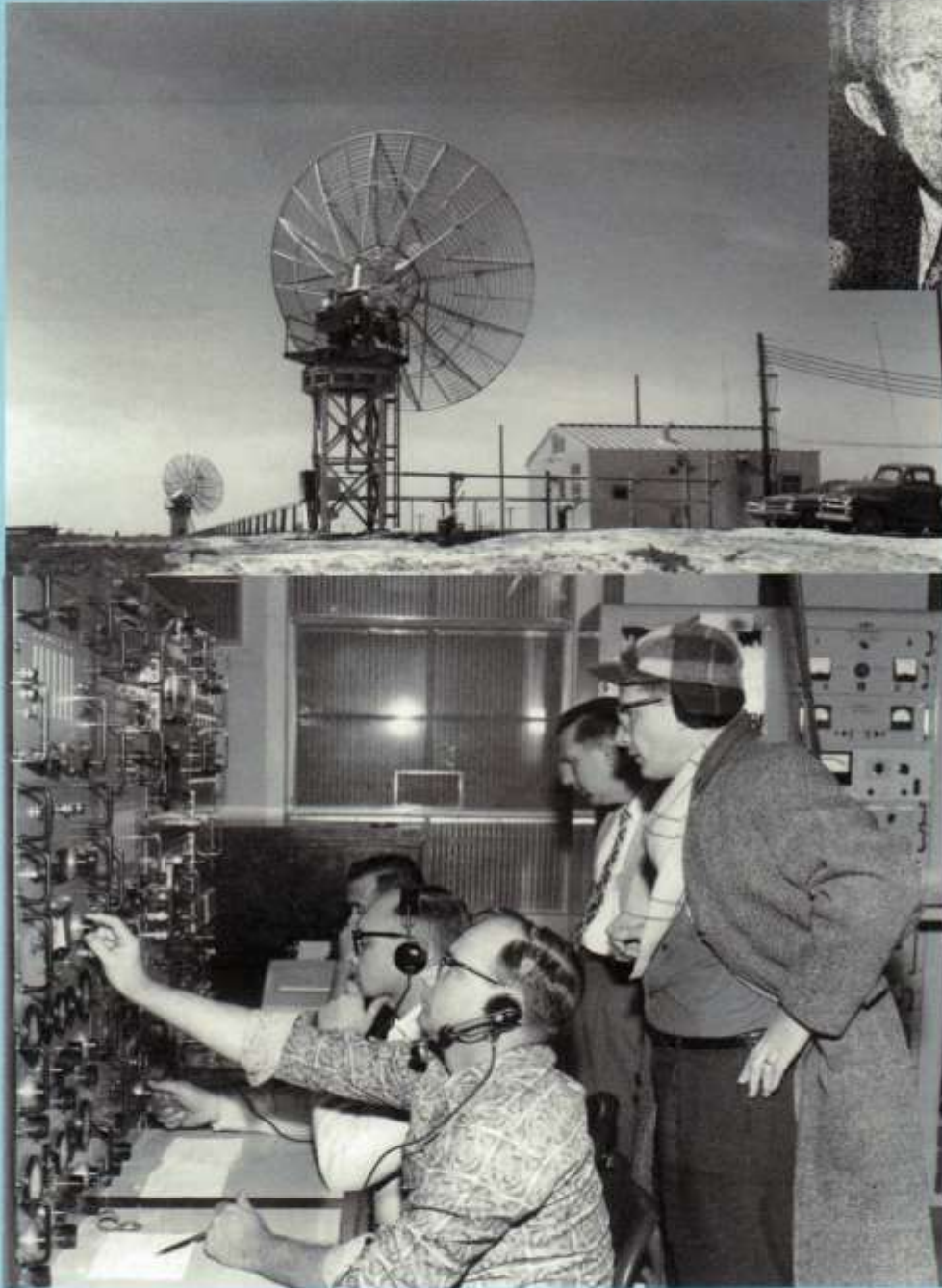
Collins Radio Co. transmits the first image via Echo satellite at 12:58 AM, August 19, 1960